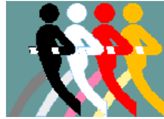
Vacumed ( www.vacumed.com )