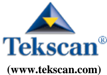
( www.tekscan.com )